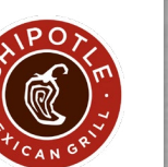
SCOTT BOATWRIGHT CEO, Chipotle

What we serve today helps define the world we live in tomorrow.